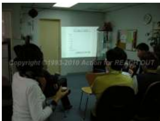
(Talk on Personal Finance Management, Jan 2010)