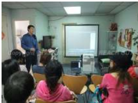
(Talk on Fire Safety, Mar 2010)