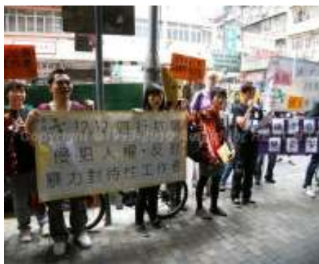
(AFRO's Rally, Dec 2010)