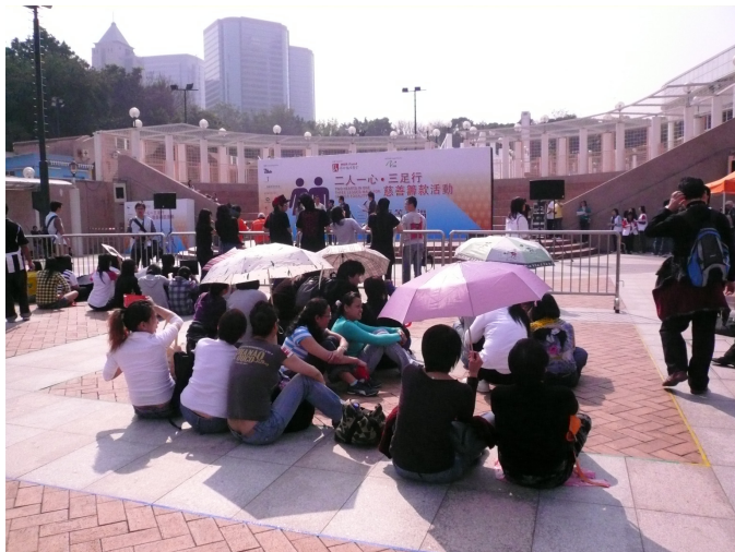
(International Women's Day activity organised by HER Fund on 2 Mar 2008)

In the year 2007/08, through seminars, talks, visits and interviews etc., we continued to have sharing and exchange with different groups and individuals, including Asia-Pacific Network of Sex Workers, Global Alliance Against Traffic in Women, American Women's Association, Collective and Sex workers and Supporters (Taiwan), Midnight Blue, Senior Citizens Home Safety Association, medical practitioners from Malaysia and Mainland China, students from the University of Hong Kong, the Chinese University of Hong Kong, Lingnan University, the Hong Kong Polytechnic University, Hong Kong Shue Yan University, Hong Kong Baptist University, Hong Kong College of Technology, the Hong Kong Academy for Performing Arts, Springboard Programme by Caritas-HK, and graduate students from Canada etc.