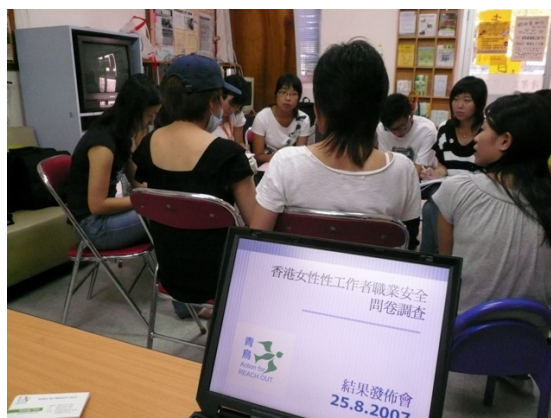
(Press conference on 25 Aug 2007)

A press conference was held by AFRO on 25 Aug 2007 for the release of findings of “A Survey on Occupational Safety of Female Sex Workers in Hong Kong”. And the serial murders in March 2008 had aroused media concern and drew coverage on issues including violence against sex workers, sex workers’ safety, police abuse, decriminalisation of sex work etc.