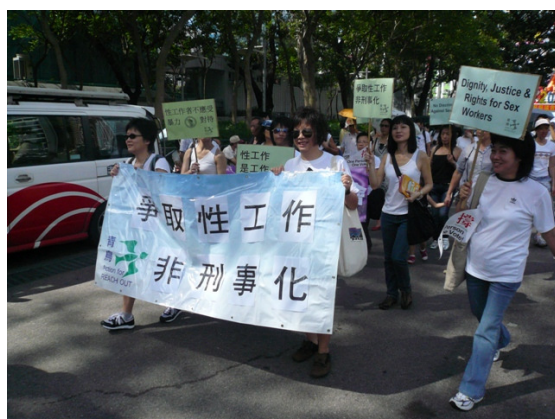
(1 July Rally)

The theme of July 1 Rally 2008 was “One World, Universal Human Rights”. The arrangement this year was to have grass-root workers, ethnic minorities and sex workers staying at the front of the group. AFRO had also mobilised sex workers, members and volunteers to join the rally and stayed with friends from the Hong Kong Women’s Coalition on Equal Opportunities at the back of the group.