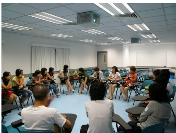
(“Understanding Society, Advocate for human rights” Workshops)

In July and August 2007, AFRO organised a community integration programme with the theme “Understanding Society, Advocate for human rights”. It was supported by the Committee on the Promotion of Civic Education. Through the 5-session workshop we explored the concept of human rights with the participants and together identified and understood the human rights issues that sex workers had to tackle. After the workshop, we together worked on public activities for International Human Rights Day and World AIDS Day.