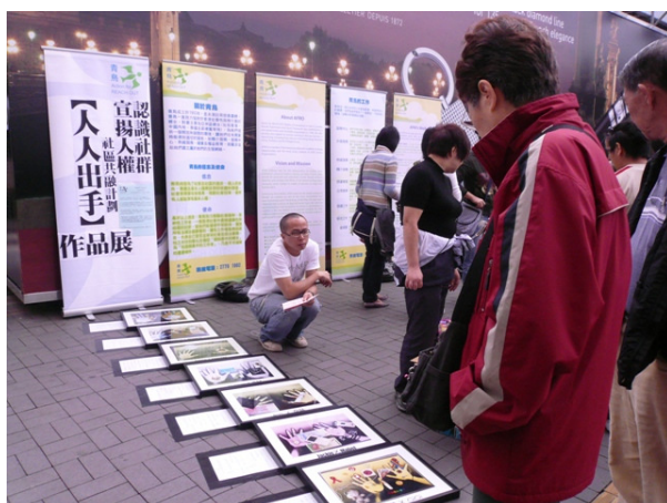
(Exhibition on 9 Dec 2007)

Participants also worked with seven sex workers to create seven photographs that were presented for public display at the Tsim Sha Tsui Star Ferry Pier on 9 December 2007. These seven photographs were not artistic showpieces; these were reflections of sex workers’ desires to be understood and not left isolated.