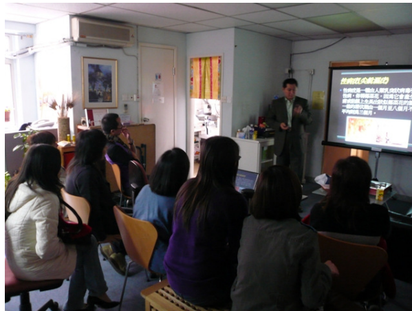
(A talk on HIV/AIDS and STI)

Besides outreach visits, we also organised different centre-based activities to promote occupational safety and health, human rights, legal rights etc. For example, a talk on HIV/AIDS and STI (17/1/08), discussion on decriminalisation of sex work (30/4/08), peer education etc. At the same time, we also organised skills training, an English class, computer class, and other activities including birthday parties, Christmas party (19/12/07), Chinese New Year Celebration (22/2/08), TV Station tour, cooking class, Yoga class, Self-defense class etc.