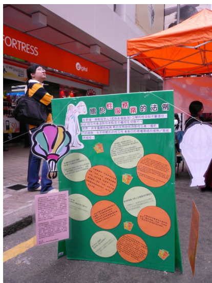
(International Human Rights Day 2007)