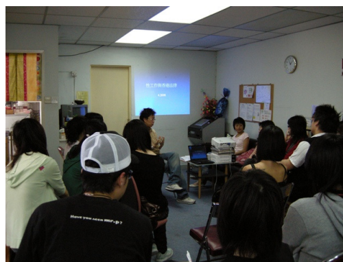
(Day time volunteer training)

To recruit more day-time outreach volunteers, we organised a training programme in April 2008. After the training and practicum sessions 9 out of 18 participants qualified and became outreach volunteers of AFRO.