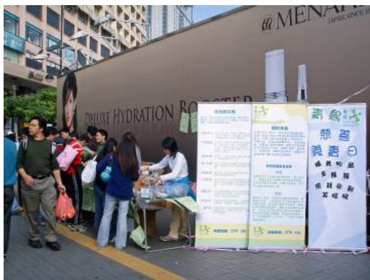
(Fun Raising Sale)

The Sale was held on 12 January 2007 at the Tsim Sha Tsui Star Ferry Pier. We are grateful to our volunteers, colleagues and friends for help, support and in-kind donation. In the end, we were able to raise HK$10,846.40. We were inspired by the unexpectedly good result and would start prepare for another sale in 2007/08.