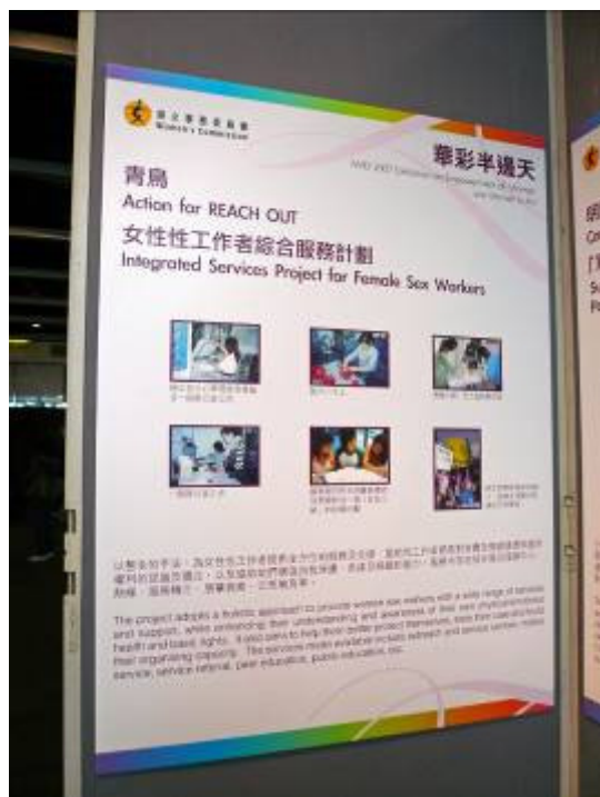
(International Women's Day)

In 2006/07, we organised/participated in a number of public education activities on certain important occasions, i.e. International Day for the Elimination of Violence against Women (25.11.06), World AIDS Day (1.12.06), International Human Rights Day (10.12.06), International Women's Day (8.3.07), and the 2 nd Hong Kong Sex Cultural Festival (27/5/07) etc.