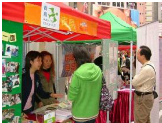
(International Human Rights Day)