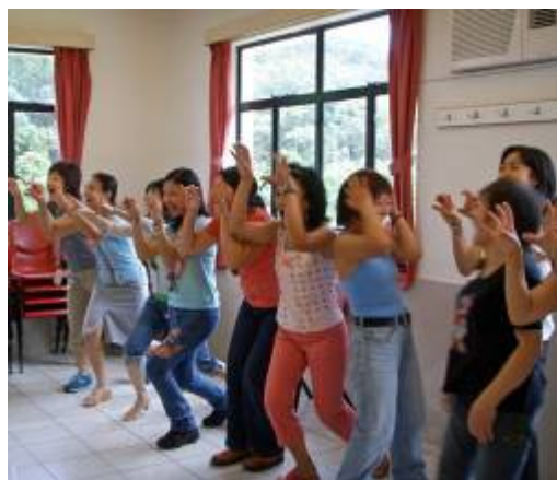
(Volunteers and Family Day)

In 2006/07, a series of activities were organised for the celebration of birthdays and festivals e.g. the Chinese New Year, Christmas etc. This year, we have made special efforts to facilitate volunteers to join women clients and their children for fun activities. We believed that it would create an opportunity for them to meet and interact somewhere other than the workplaces, and thus to get to know each other from a different perspective. The activities organised included “Volunteers and Family Day” (9/7/06; Po Leung Kuk Pak Tam Chung Holiday Camp in Sai Kung), “Disneyland Visit” (28/8/06, 16/6/07) and “AFRO’s Happy Tour – Visiting Hong Kong Museum of Coastal Defence and Stanley” (22/4/07), and watching the movie “Whispers and Moans” (29/5/07) and the drama “Tuesdays with Morrie” (14/6/07).