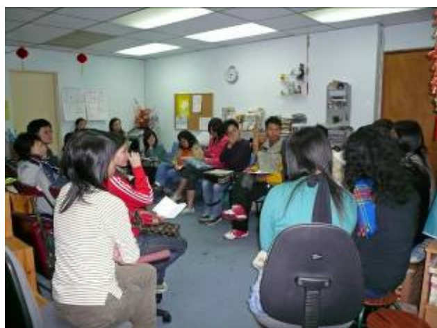
(Public Education Workshop)

A series of public education workshops were held in January and February 2007. The 20 participants were from different universities and organisations. The real human interaction provided a chance for the participants to better know sex workers and the industry. The participants found most of the sex workers they met very friendly and nice. Some of the participants had shown interest to become volunteers of AFRO. Therefore, we especially organised a volunteer training in June 2007.